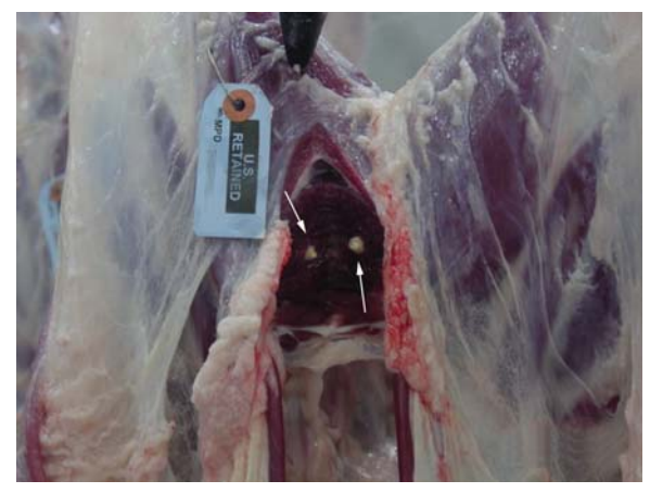
Condemned carcass due to Cysticercosis ovis found in the leg muscles.

Muscular Cysticercosis or "measles" in sheep is characterized by the development of cysts, often degenerated, in skeletal muscle, heart muscle, and the diaphragm. Cysts are first grossly visible about two weeks after infection as a pale, semitransparent spot about 1.0mm in diameter. Cysts reach maturity in about 12 weeks and are white in color and about 1.0 cm. These cysts may later calcify.